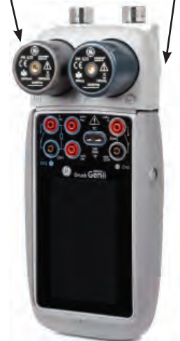
MC620G Pressure Module Carrier. Securely attaches to the DPI620G when pressure measurement is required

Measure and source mA, mV, V, ohms, frequency, RTD's and thermocouples