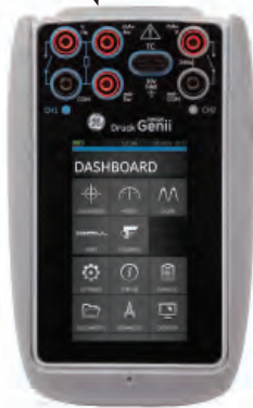
DPI620G Multifunction Calibrator and Communicator