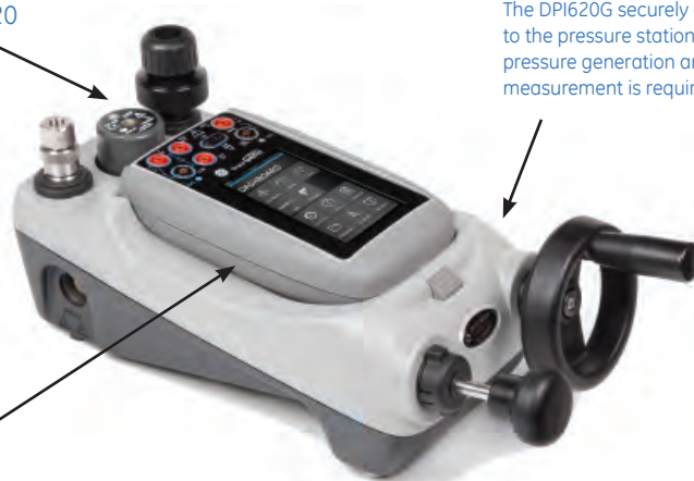
PV62XG Pressure Station. The DPI620G securely attaches to the pressure stations when pressure generation and measurement is required

Re-rangeable pressure measurement and generation from 25 mbar (10 inH 2 O) to 1,000 bar (15,000 psi)