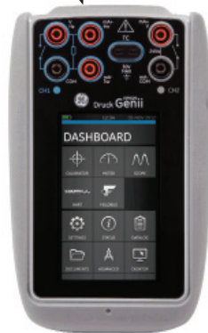
DPI620G Multifunction Calibrator and Communicator