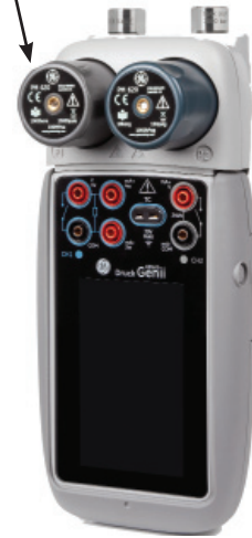
MC620G Pressure Module Carrier. Securely attaches to the DPI620G when pressure measurement is required