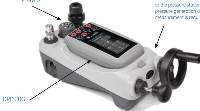
PV62XG Pressure Station. The DPI620G securely attaches to the pressure stations when pressure generation and measurement is required